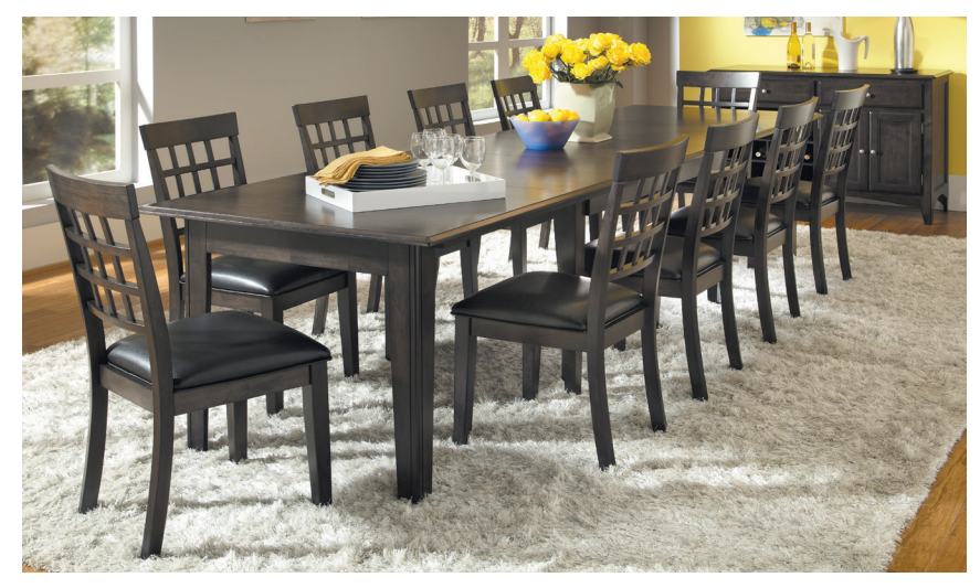
GRID BACK CHAIR BTL-WG-2-73-K 18"W x 38"H x 21.75"D

RECTANGLE VERS-A-TABLE BTL-WG-6-17-L 38"W x 61"-132"L x 30"H